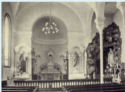
1912 Winter Chapel: Statue of St. Anthony of Padua. Feast June 13th (1195-1231. Canonized 1232) pictured in the left niche.

"St. Anthony's Bread" You likely associate it with the envelopes found in the back of church. The origin of this Franciscan charity program actually has something to do with the food for which it was named. Different legends account for the donation of what is called St. Anthony's Bread. In 1263, when it is said a child drowned near the Basilica of St. Anthony which was still being built, his mother promised if the child was restored to her she would give for the poor an amount of corn equal to the child's weight. Her prayer and promise were rewarded with the boy's return to life.